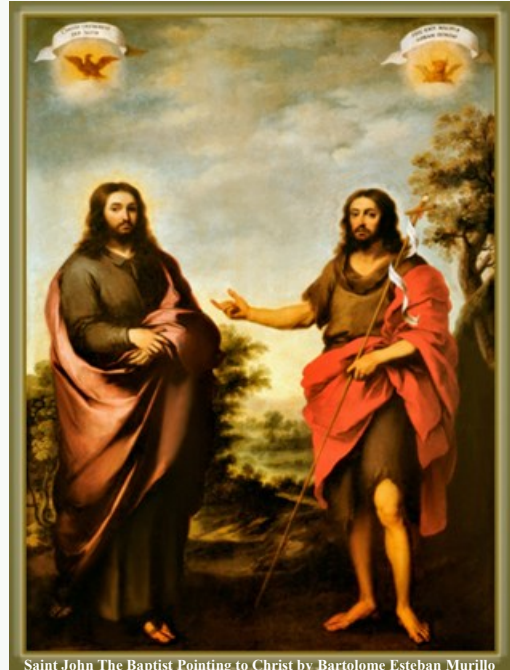
Saint John The Baptist Pointing to Christ by Bartolome Esteban Murillo