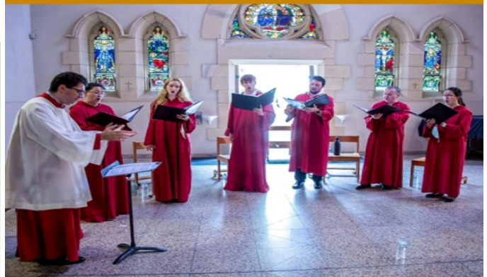
Cathedral of St Stephen, Fridays, 12pm, 27 Feb-27 Mar 2026

A Lenten Concert Series is being held each Friday throughout Lent at the Cathedral of St Stephen, Brisbane, from 27 February to 27 March, beginning at 12 noon, just before the 12:30pm Mass. These special midday concerts are a beautiful way to enter more deeply into the spirit of Lent through sacred music. Each concert offers sacred music on the Cathedral's Organ and Piano, inviting all to pause in reflection and spiritual renewal. We hope you can join and share in this time of prayerful preparation for Easter