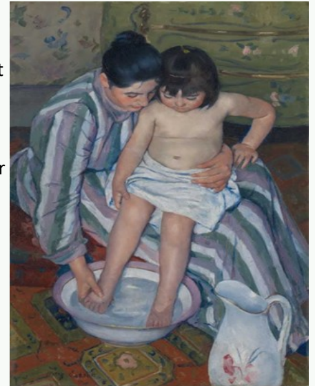
The Child's Bath, Mary Cassatt 1893

MOTHERS DAY: This weekend we celebrate Mother's Day. We pray for all mothers in gratefulness for the gift of life and nurturing they have given. We remember those who have died and are with us in the resurrection. Those preparing for motherhood are also in our prayers as they wait expectantly for what lies ahead.